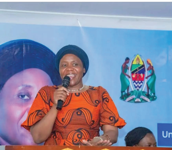
The Guest of Honour, Hon. Dr. Dorothy O. Gwajima (MP), delivering a speech during the event.

The CSO Knowledge Hub was inaugurated on July 31, 2023, in Dar es Salaam by the Honourable Minister for Community Development, Gender, Women, and Special Groups – Dr. Dorothy O. Gwajima (MP). A total of 42 individuals (19 female, 21 male) attended the event, including representatives from the French Embassy, the High Commission of Canada in Tanzania, and the British High Commission.